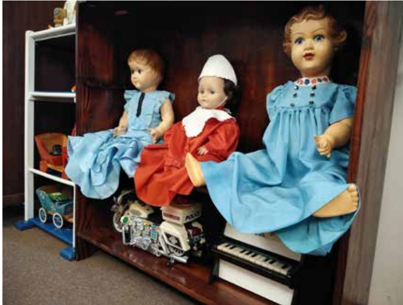
Pict. 3: Dolls: the Ustroń Museum. July 16, 2018.

Ethnographic museology, which aims to document various aspects of the culture of the dynamically changing everyday life, has been trying in various ways and for many years to determine the criteria for selecting items that will be directed either to the museum storage or directly to the exhibition. 18 Consumer culture, with its excess of production of objects of all types – including toys for children, does not facilitate this task for the museum personnel. 19 Creating a museum narration about childhood always involves a certain amount of doubts, regarding, for example, which objects to choose, keep and show in the museum. Modern toys, which are a part of everyday life of today's generation of children, are also the next link, illustrating the transformation of the toy assortment. Currently, toys are becoming out of date at an incredible pace, because they are being replaced by a flood of subsequent layers of mass toy production. In the near future, the same will be true for the currently fashionable and desirable children's toys, and the question will be asked: which of them should “rest” in the museum to show the next generations of children what their parents', grandparents' and great-grandparents' toys used to look like.