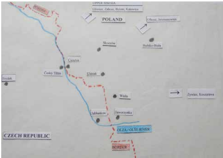
Pict. 1: Map Cieszyn Silesia region

be taken into consideration by researchers who, on the basis of the available museum sources, attempt to draw conclusions about the former folk culture of children in a given region.