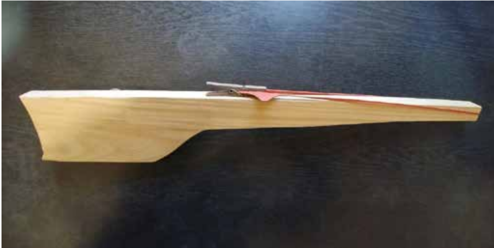
Pict. 4: Flinta : Museum of Cieszyn Silesia in Cieszyn. Nov 9, 2018.

Out-of-use museum toys have also become a carrier of knowledge about the region's cultural traditions through highly popular workshops, craft stands, meetings with folk artists that make toys according to given patterns – all of which are part of cultural events and events co-organized by local museums. The specifics of the local ludic culture can also be found in the linguistic layer of the region's culture. In the past, similar toys and games were perhaps widely known in individual regions, but they have gained separate names specific to a given area; these names may still be remembered by the oldest inhabitants of the region. The reference on the basis of toy museum collections to the specifics of the ludic culture of the youngest inhabitants of Cieszyn Silesia – the region which was divided by the Polish-Czech border since 1920, also requires further research on the issue of the popularity of some toys spreading across the border of the Olza River.