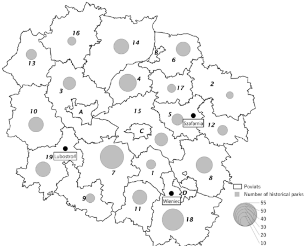
Fig. 1: Number of PPCs in Kujawsko-Pomorskie Voivodeship in 2018 by poviats