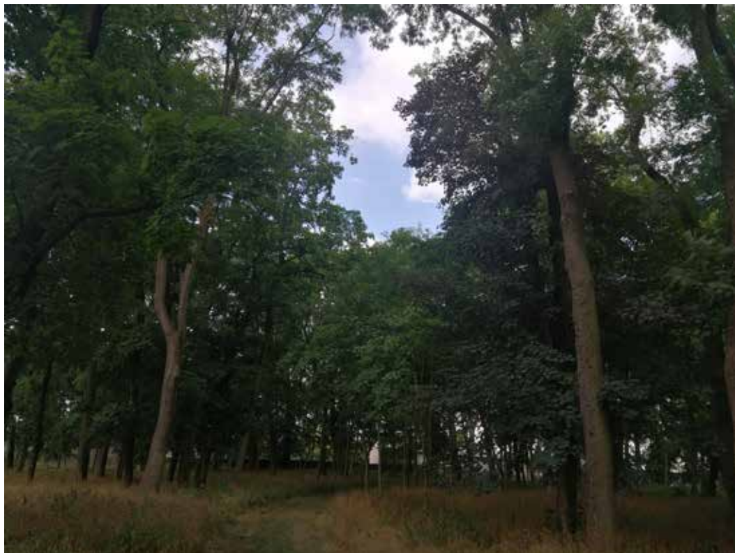
Pict. 2: Historical park in Wieniec around the Kronenbergs' Palace