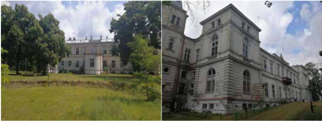
Pict. 1: The Kronenbergs' Palace in Wieniec (on the left is a part of the eastern elevation, on the right, part of the western elevation)