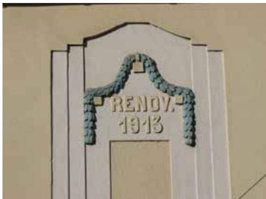
Fig. 5: Detail of the façade