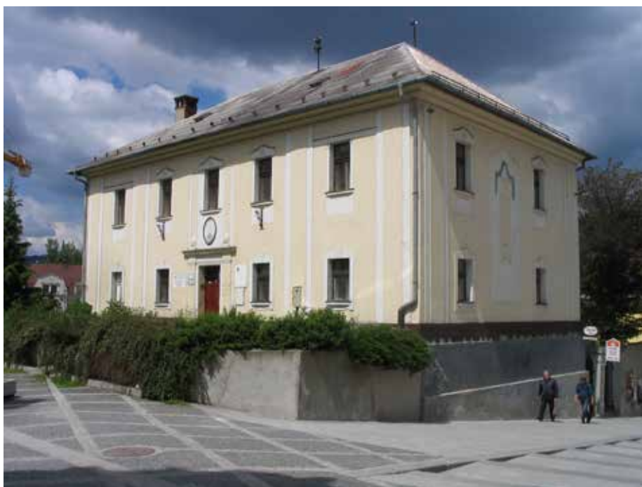
Fig. 4: The Rectory several weeks before its demolition