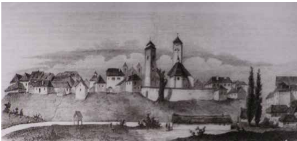
Fig. 1: The town of Žilina in the middle of the nineteenth century