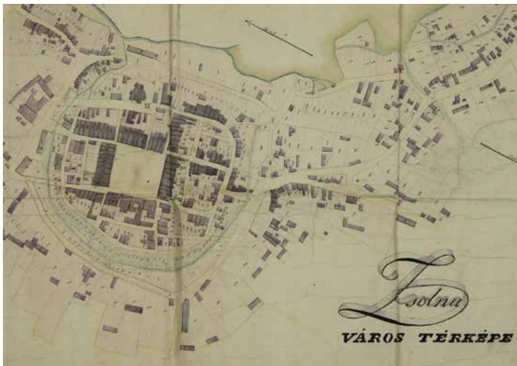
Fig. 3: The map of the town, 1848