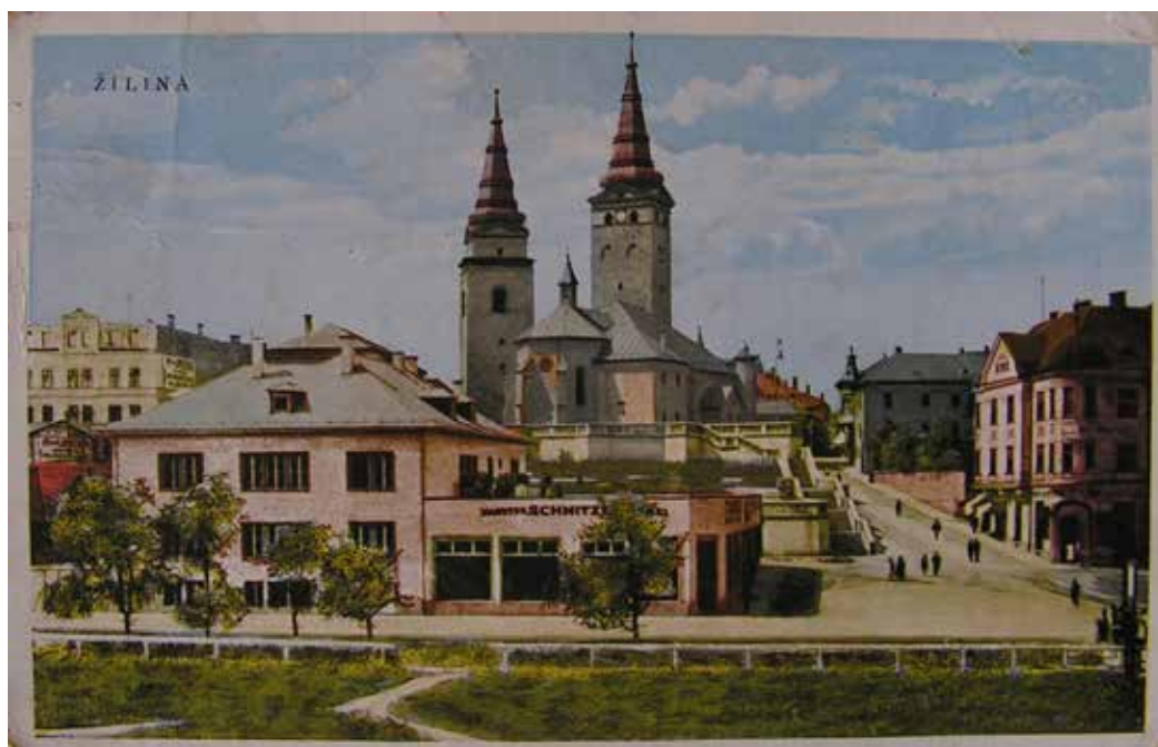
Fig. 2: The Holy Trinity Church and the Rectory at the beginning of the twentieth century (Regional Monuments Board of Žilina)