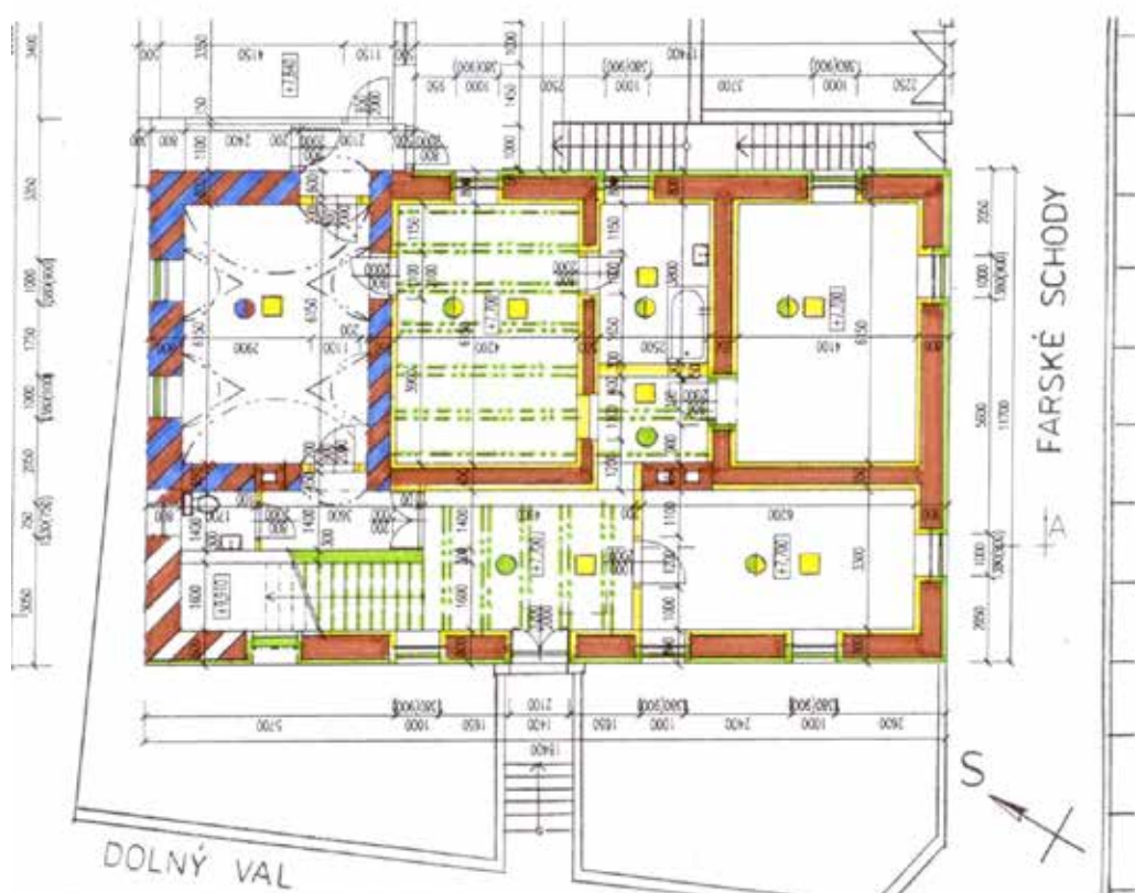
Fig. 8: The construction development of the Rectory according to the architectural-historical study –ground floor plan (Regional Monuments Board of Žilina)