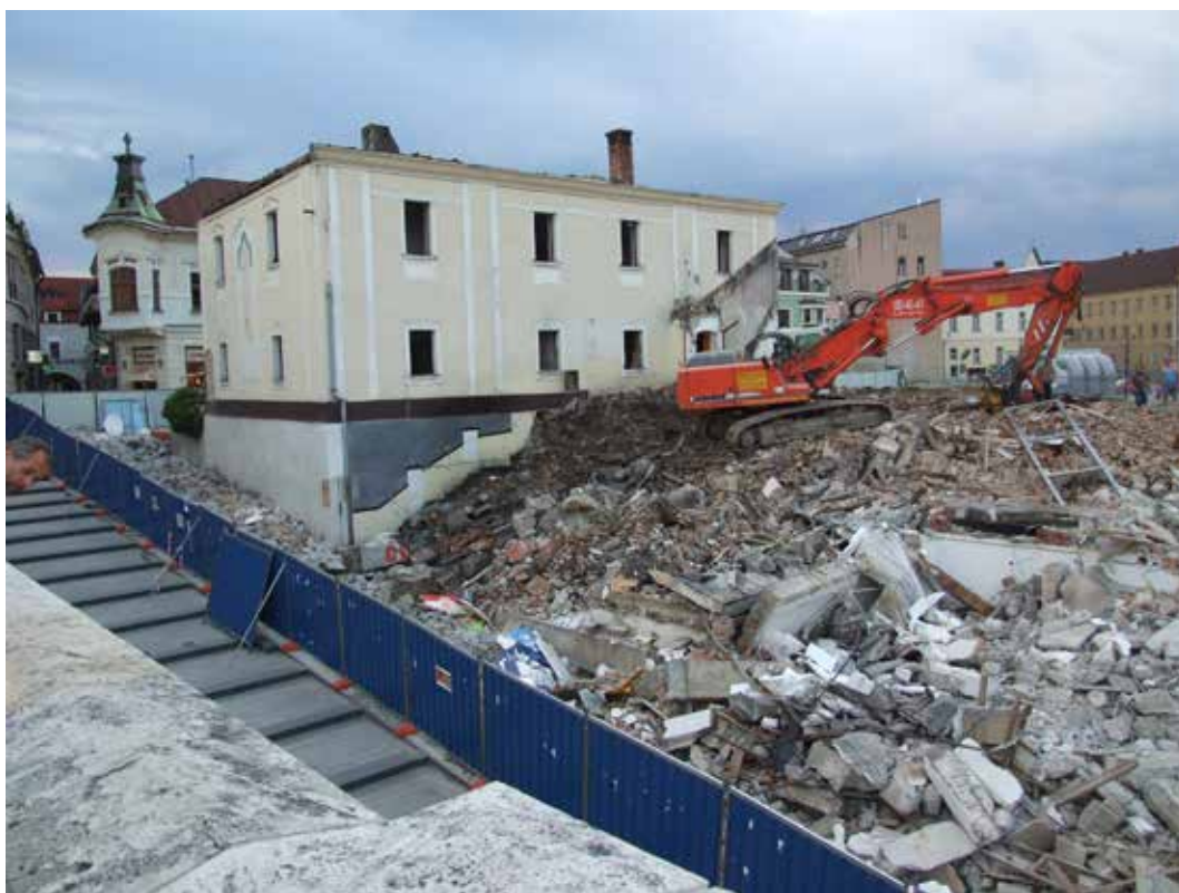
Fig. 7: The beginning of the Rectory's demolition, July, 2008