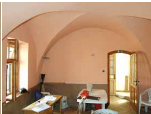
Fig. 6: The oldest room of the rectory, dating from the Late Medieval or Early Modern era