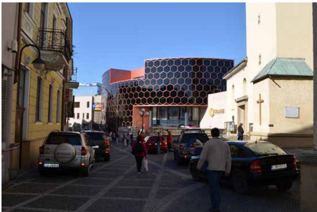
Fig. 12: New shopping centre on the site of the former Rectory