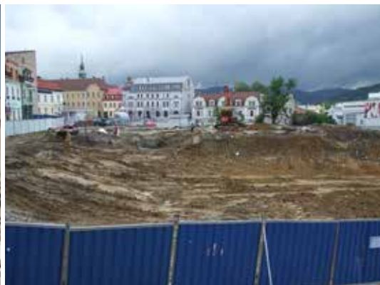
Fig. 11: The Rectory plot one week after demolition