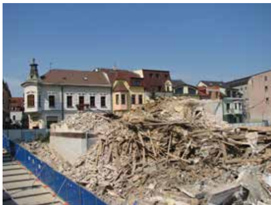
Fig. 10: The remains of the Rectory on Sunday morning, July 13, 2008