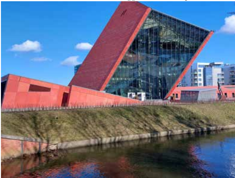
Fig. 9: Museum of the Second World War, Gdansk, Poland.

This leading exhibition aims to show Europe and the world the wartime experiences of Poles and other nations of Central and Eastern Europe. These experiences were, in many respects, different from those of Western Europeans. The exhibition also emphasises that Poland fell victim to two sets of aggressors/ occupiers and that the effects of the Second