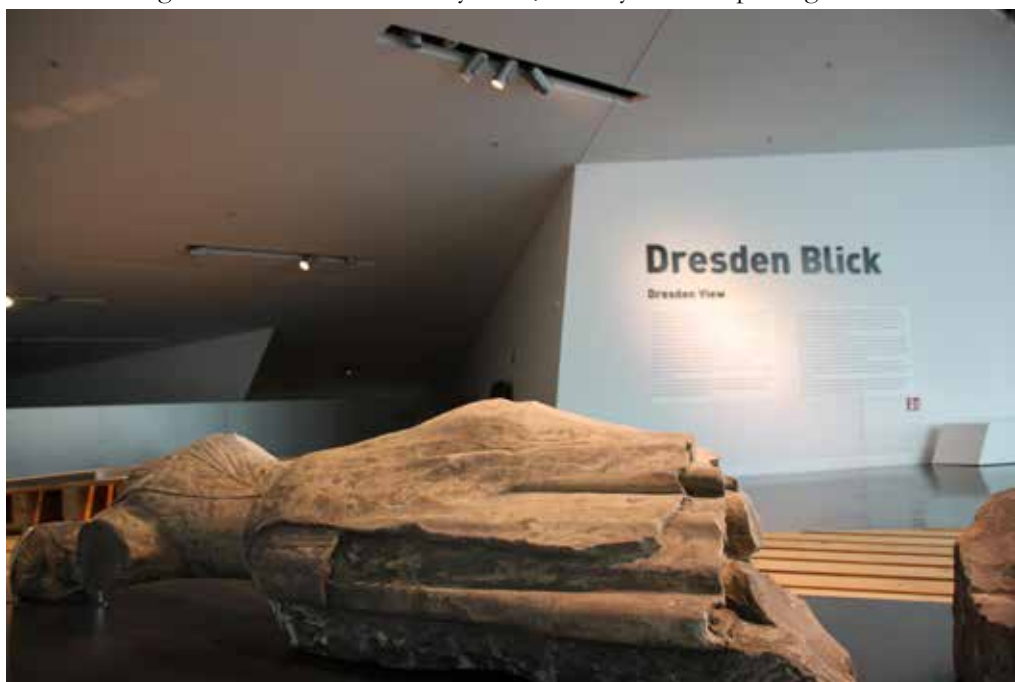
Fig. 8: Fragments of the Orphan Girl sculpture from Rotterdam, Netherlands.

The exhibition also features exhibits such as a photograph of Rotterdam, Netherlands, following its destruction in 1941, and fragments of the Orphan Girl sculpture created by Dutch sculptor Johannes de Graef in 1763 for the Rotterdam orphanage. The German Air Force's bombing of Rotterdam on 14 May 1940, destroyed the orphanage and the entire city