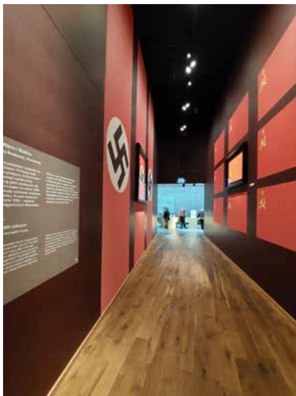
Fig. 10: Corridor to the section on “Collusion between Hitler and Stalin” at the Museum of the Second World War in Gdansk, Poland.

The exhibition highlights the contrast between the idealised depiction of the world presented by the official propaganda of the three European totalitarian regimes and the harsh realities of repression, ruthless rule, collectivisation and the Great Famine of the 1930s in Ukraine. This contrast aims to reveal the darker sides of totalitarian regimes and their impact on society. Additionally, the exhibition explains the role of totalitarian ideologies in instigating the Second World War. The exhibition presents the Soviet Union as a communist state of mass terror. This narrative is illustrated by exhibits in the form of an original hand-mill from a village in Ukraine; a Nagan revolver – part of the equipment of the Red Army and Soviet security organs in