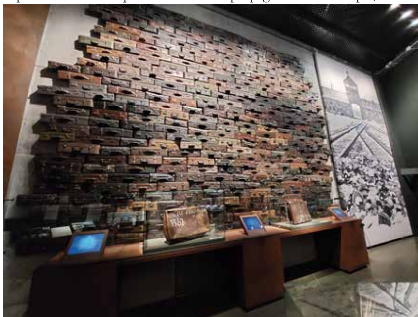
Fig. 11: Section on “Holocaust” at the Museum of the Second World War in Gdansk, Poland.

The space dedicated to “Annexation of countries in Central and Eastern Europe, 1939–1940” consists of two parts. The first refers to the design of the so-called red corners, quasi-religious propaganda performances created in virtually every public institution and workplace under Soviet occupation. Objects exhibited in this section illustrate the totalitarian regime policy implemented in places annexed to the Soviet Union in 1939 and 1940, including territories from Poland, Estonia, Latvia and Lithuania, as well as two regions of Romania (Bessarabia and Bukovina), demonstrating the reign of terror against leadership elites and “class enemies”, mass deportations and ubiquitous communist propaganda. For example, there is a 1941 communist