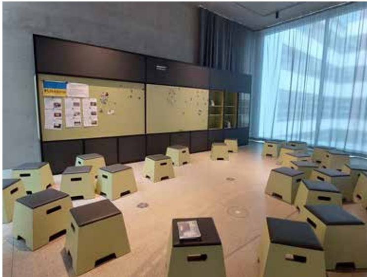
Fig. 4: Space for communication with visitors in the foyer on the first floor at the Documentation Centre for Displacement, Expulsion, Reconciliation.