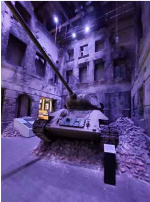
Fig. 13: Section entitled “After the war” at the Museum of the Second World War in Gdańsk, Poland.

The section entitled “After the War” displays a demolished street scene featuring a Soviet T-34 tank amidst the rubble. It symbolises the Red Army’s liberation of Poland from German occupation but also serves as a reminder of the Soviet’s subsequent domination in Poland and other Eastern European countries. Display cases throughout the scene illustrate the scale of the losses during the war, with particular attention to the dead, representing a panorama of