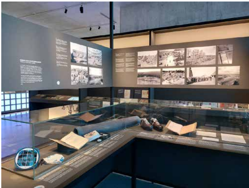
Fig. 2: The “Transit and Temporary Camps” section of the exhibition at the Documentation Centre for Displacement, Expulsion, Reconciliation.

“War and Memory”, “Politics and the Use of Force” or “The Military and Technical Progress”. 36