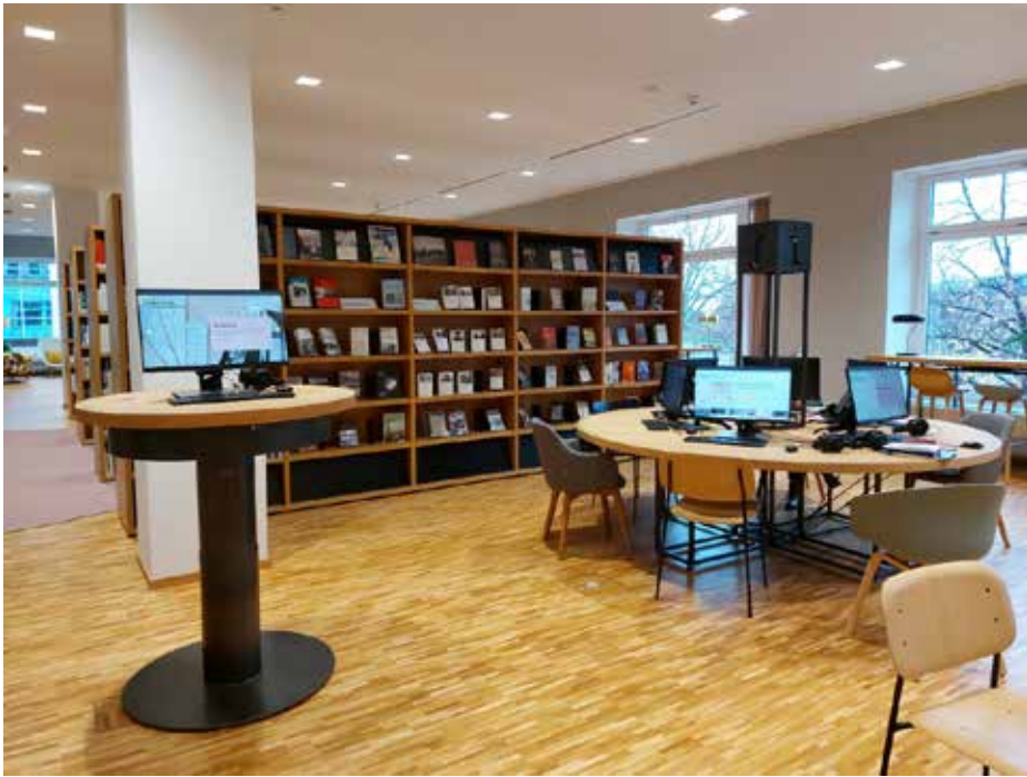
Fig. 3: The Library and Testimony Archive at the Documentation Centre for Displacement, Expulsion, Reconciliation.

two other European cities, Wielun and Rotterdam, during the Second World War. 38 The new extension forms a symbolic link with Dresden and its destruction in the Second World War in