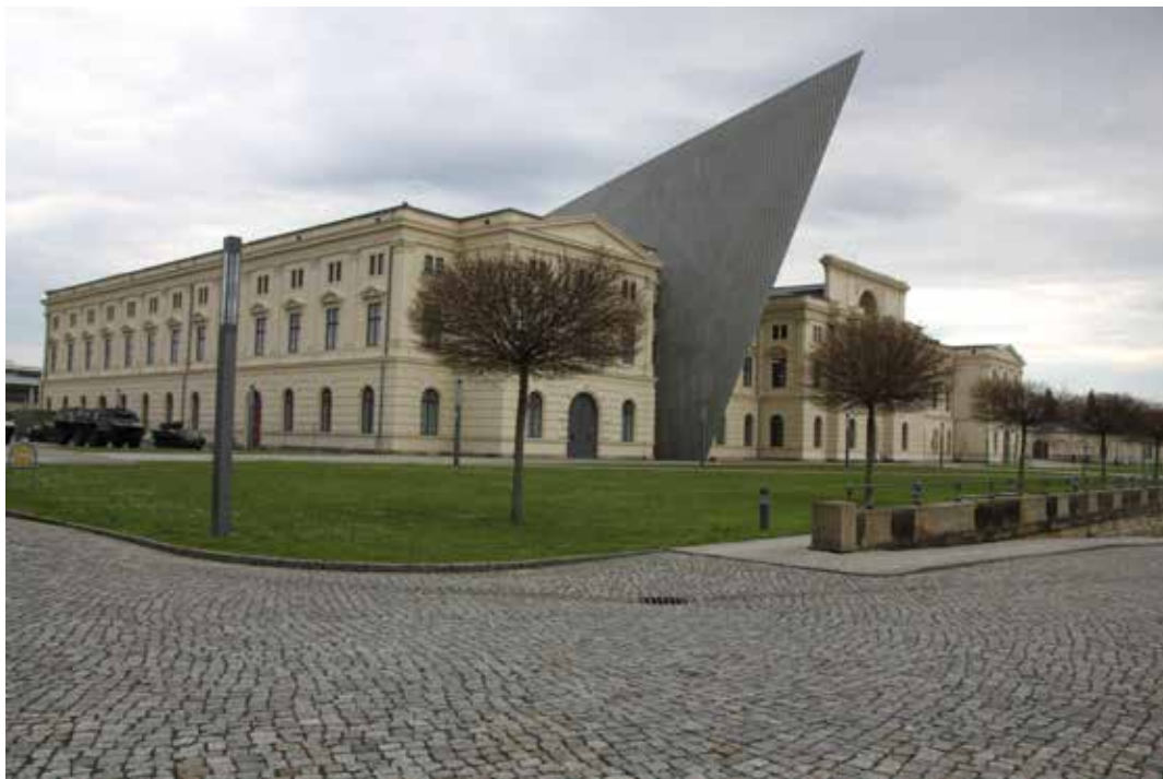
Fig. 5: The old building and the new architectural extension of the Bundeswehr Museum of Military History, Dresden.