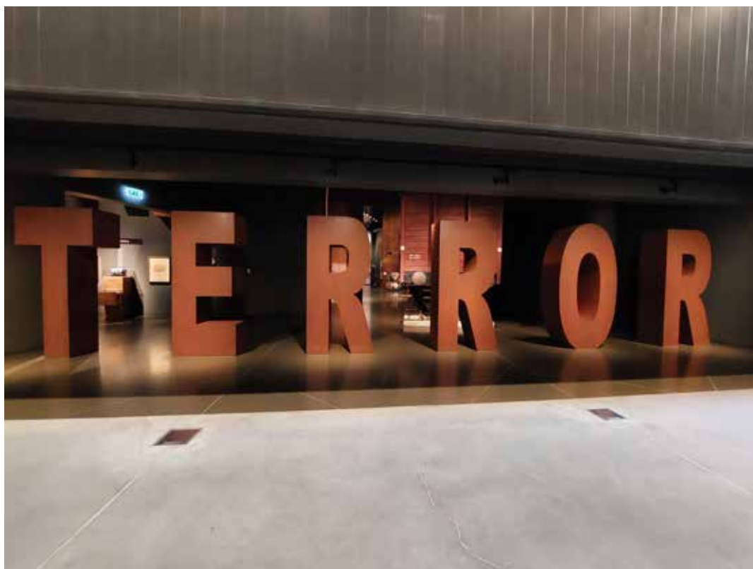
Fig. 12: Section on “Terror” at the Museum of the Second World War in Gdansk, Poland.

The design of the section devoted to the terror of occupation regimes opens with a monumental inscription “TERROR”. Visitors must walk between these letters to access the room, which displays a cattle car for a train that was used during the war to transport people. The Soviet regime used such wagons to deport Polish citizens and its own people to gulags in the east, while the Germans used them to transport people displaced from lands incorporated into the Reich, including forced labourers, prisoners sent to concentration camps, and Jews to sent to extermination centres. This space is the starting point for exploring the subsequent