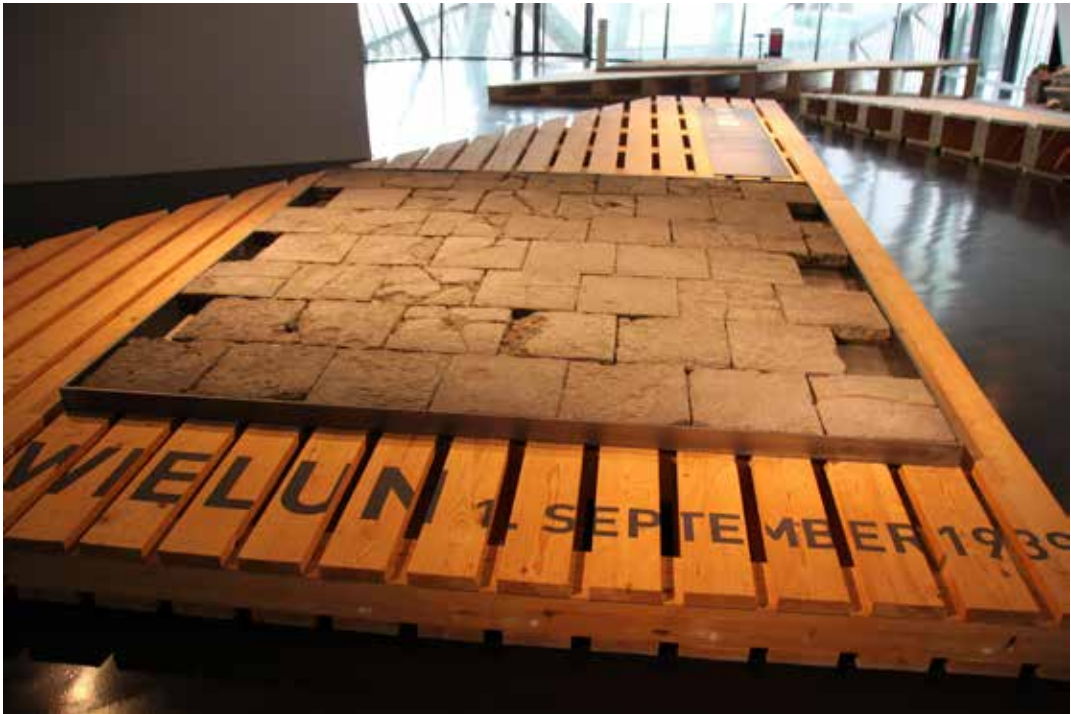
Fig. 7: Paving stones from the town of Wielun in Poland devastated by the German attack on 1 September 1939.

February 1945. With an acute angle of 40.1 degrees, the wedge-shaped museum extension has the same shape as the destroyed area of the city. 39