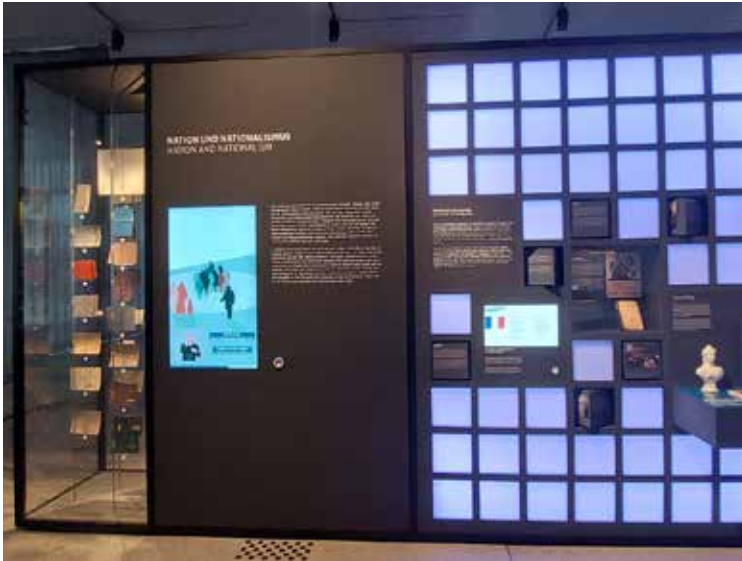
Fig. 1: The thematic island “Nation and Nationalism” at the Documentation Centre for Displacement, Expulsion, Reconciliation.

The exhibition’s thematic island, “Force and Violence” focuses on the violent nature of flight, expulsion and forced resettlement and its impact on those affected. The exhibition