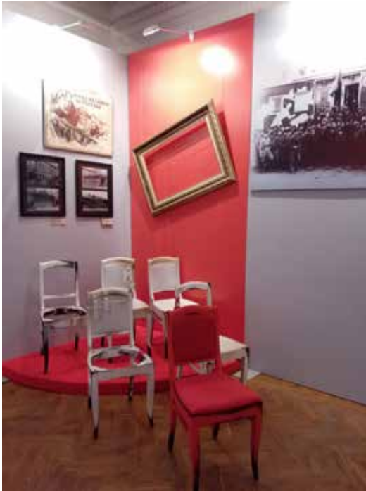
Pict. 3: The exhibition „Revolution from the first person“ (Museum of the History of the youth movement, Ryazan). The story was based on the diary of one of the residents of Ryazan.

Such distortions are aggravated by what a Russian historian V.B. Kobrin called “the era