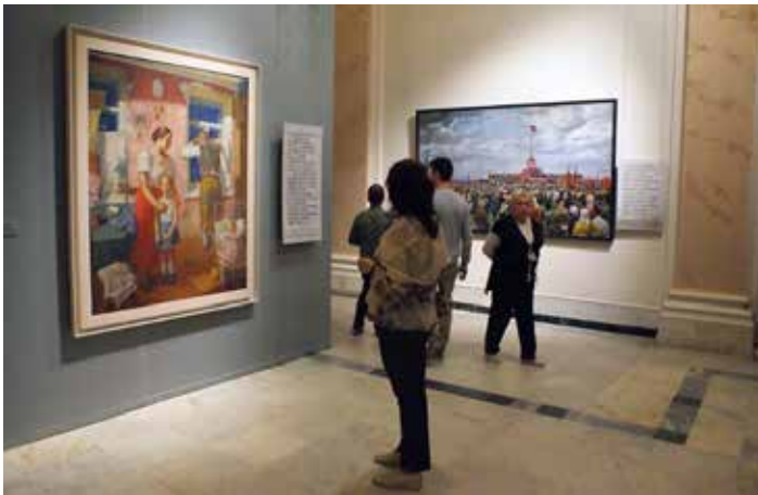
Pict. 1: The exhibition “Dreams of Universal Flowering” (State Russian Museum, Saint-Petersburg). Excerpts from historical sources of that time (memoirs, correspondence, Newspapers) accompanied paintings of 1918-1920s.

The need to systemize the projects according to their content and to regulate somehow their diversity leads us to reflect on the importance of this event for modern Russia, its national identification and historical memory, as well as on the methodology of historical knowledge on the whole and the search for ways of interpreting the national history of the 20 th century in museums.